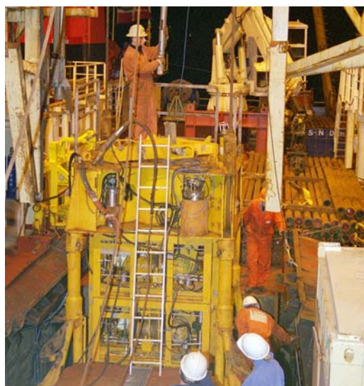
DEEP WATER SEACALF® on vessel Bucentaur