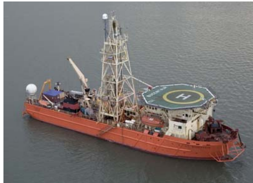
Geotechnical vessel Bucentaur

The DEEPWATER SEACALF® can be used from specialised geotechnical vessels including the Bucentaur, Bavenit, or Uncle John. Alternatively it can be modified for deployment from other suitable vessels. It can be deployed on twin lines through a moonpool or via an ‘A’-frame over the stern or side of the vessel.